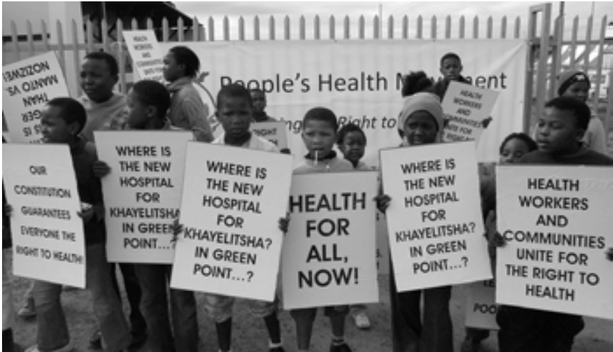
50 Right to Health campaign in South Africa (Louis Reynold)

In the last four years, the campaign has advanced significantly with RTH activities under way in the Democratic Republic of Congo, Congo, Benin, Burkina Faso, Mali, Togo, Gabon, Cameroon, Senegal, South Africa, Zimbabwe, Kenya, Morocco, Uruguay, Guatemala, Bolivia, the UK and India. Eleven of these countries have already finalised assessments reports on the Right to Health. New PHM circles have been formed in several countries that have joined the campaign. A case study of the campaign in Guatemala is briefly mentioned as an example.