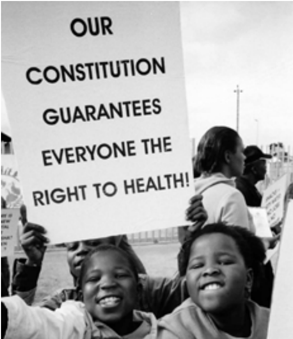
46 Children demand Right to Health at a demonstration by Peoples Health Movement in South Africa (Louis Reynolds)